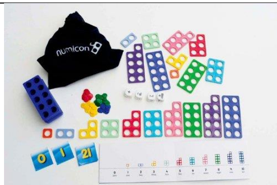
Numicon: Homework Activities - 'Maths Bag' of Resources Per Pupil