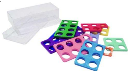
Numicon: Bag of Numicon Shapes 1-10

Maths Evening: Following the Maths Information Evening in January, we have been asked for the name of the maths equipment which was used as examples to aid reasoning and mastery. The equipment below has been sourced from Amazon but is widely available on the internet.